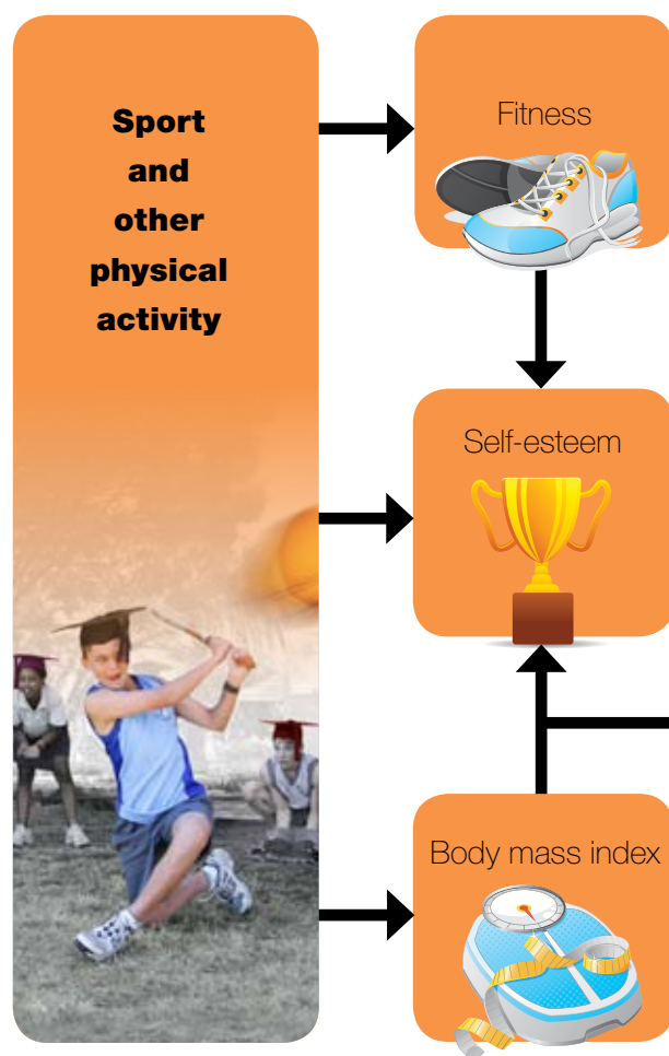
Figure 1 – Move to Learn: theoretical pathways linking physical activity, cognitive functioning and academic success

Learning can be examined from multiple contexts and is often measured via cognitive and academic testing. A multitude of learning outcomes have been compared with physical activity or assessed following physical activity interventions. This varied approach in learning measuring outcomes has led to difficulty in determining the strength of the relationship between physical activity and cognitive functioning and academic success, and in undertaking meta-analysis of data. 37 However, the strategy of measuring multiple responses has aided with identifying potential pathways between physical activity, cognitive functioning and academic success, and these have been collated to develop the Move to Learn Model (Figure 1). This model, developed for this review, highlights the multitude of pathways through which sport and physical activity have the potential to impact upon learning, test scores and academic success.