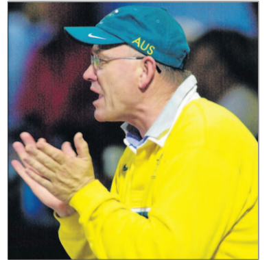
Australian hockey coach Ric Charlesworth.