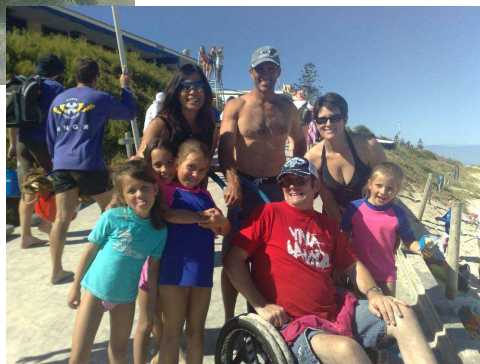
Beach Wheelchair Program