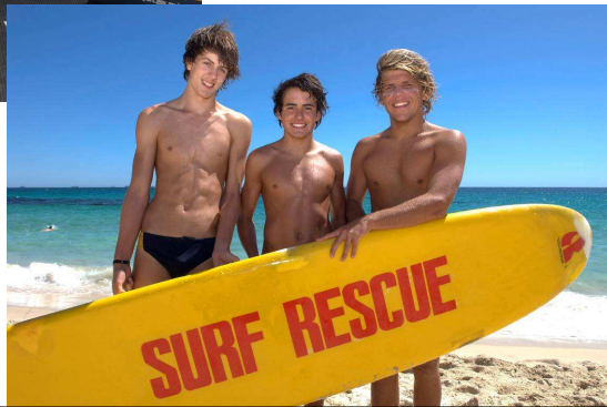
Christ Church Surf Cadets Program