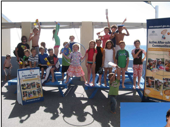
Active After-school Program