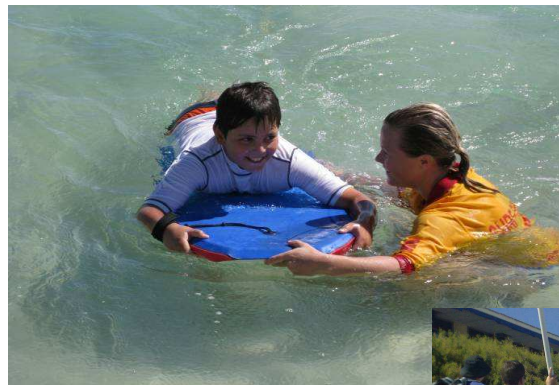
Migrant Surf Awareness Program