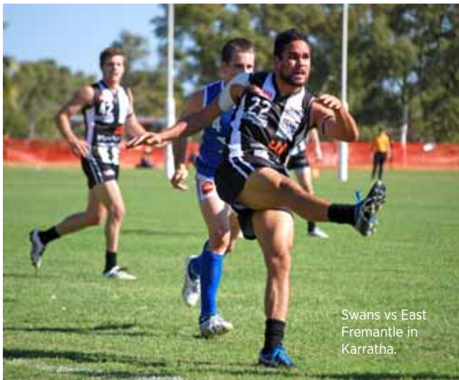
Swans vs East Fremantle in Karratha.

The long weekend in July was a busy one for all football fans, with six additional games of football being played at Kevin Richards' Memorial Oval in Karratha.