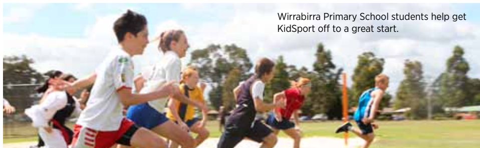
Wirrabirra Primary School students help get KidSport off to a great start.

KidSport is a new program and not all local governments have signed up yet, so you will need to check with them first. More information is at: www.clubsonline.wa.gov.au/kidsport