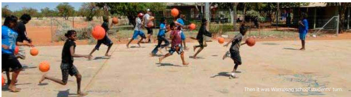
Then it was Warralong school students' turn.