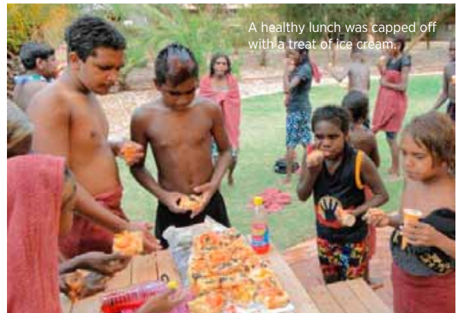
A healthy lunch was capped off with a treat of ice cream.

The day was part of a long term program to increase water safety and awareness, increase physical activity and develop good swimming techniques, with the aim of eventually running a mini swimming carnival against other communities.