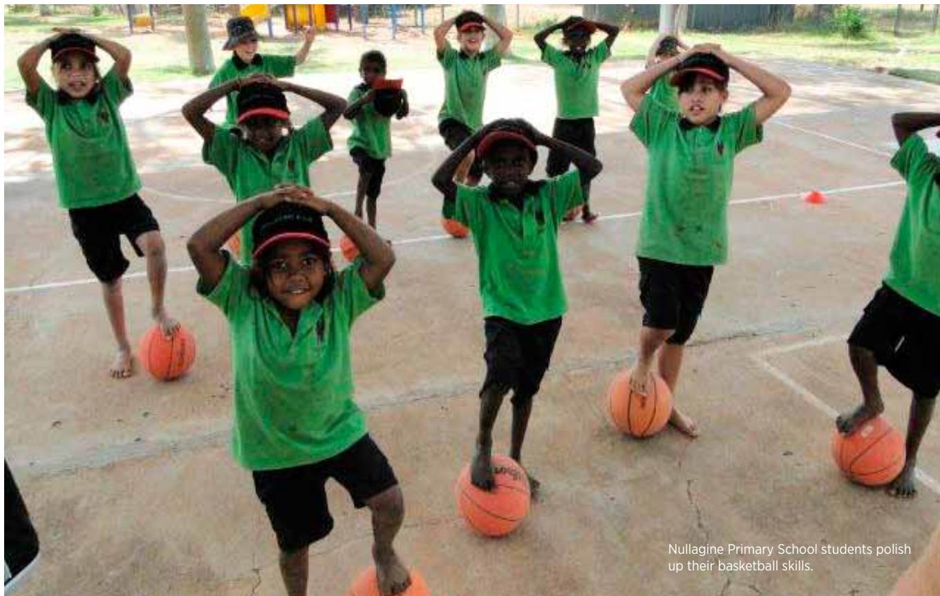
Nullagine Primary School students polish up their basketball skills.

They may live in remote communities but they still have a shot of being future stars of the National Basketball League (NBA).