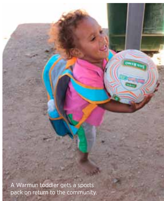
A Warmun toddler gets a sports pack on return to the community.

Work is continuing to rebuild the community.