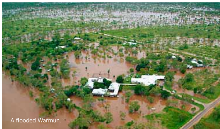
A flooded Warmun.

An emergency area was declared and a Warmun Re-Establishment Taskforce was established a