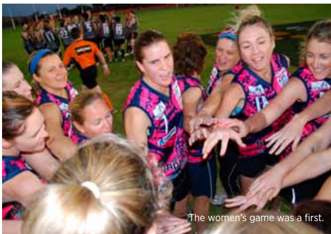
The women's game was a first.

Saturday proved to be the big day of competition, with two Pilbara Development Squads commencing the days' games by playing in front of talent scouts. All players showcased their skills and