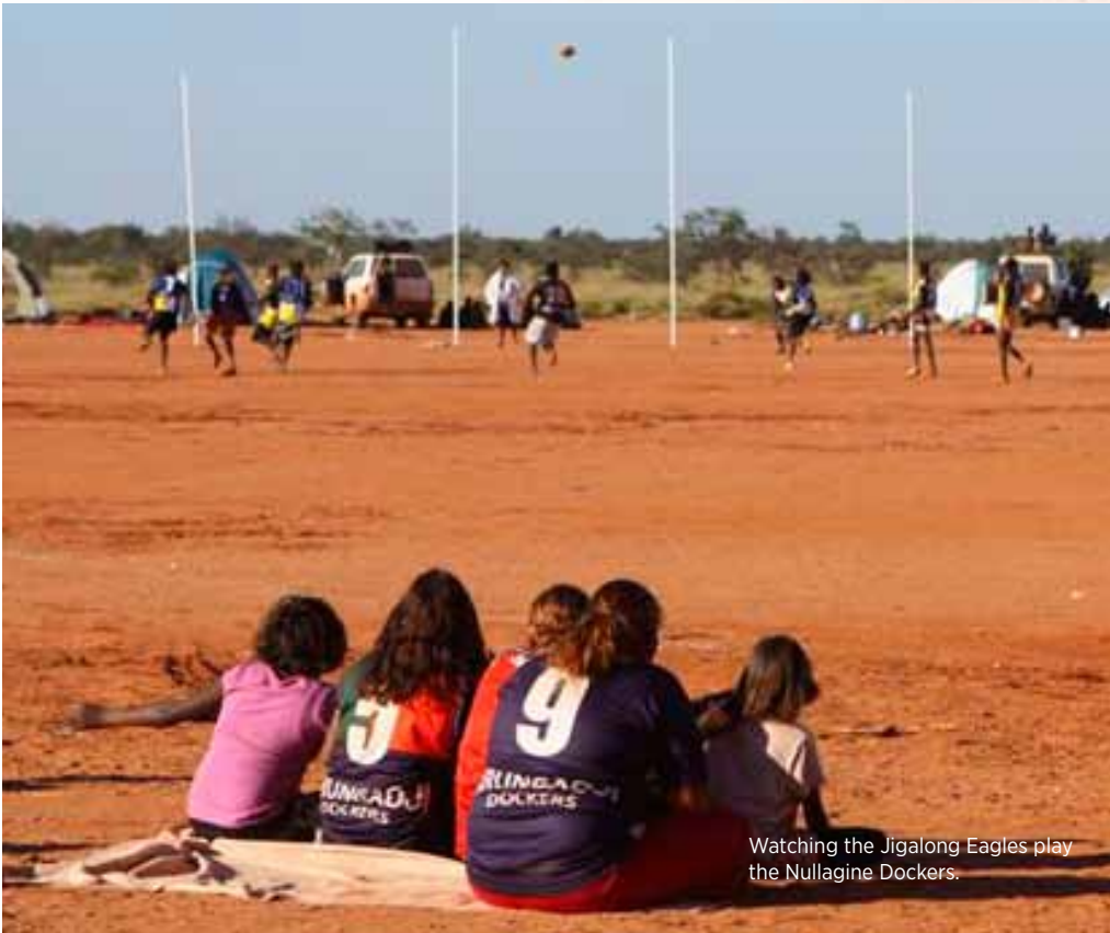
Watching the Jigalong Eagles play the Nullagine Dockers.